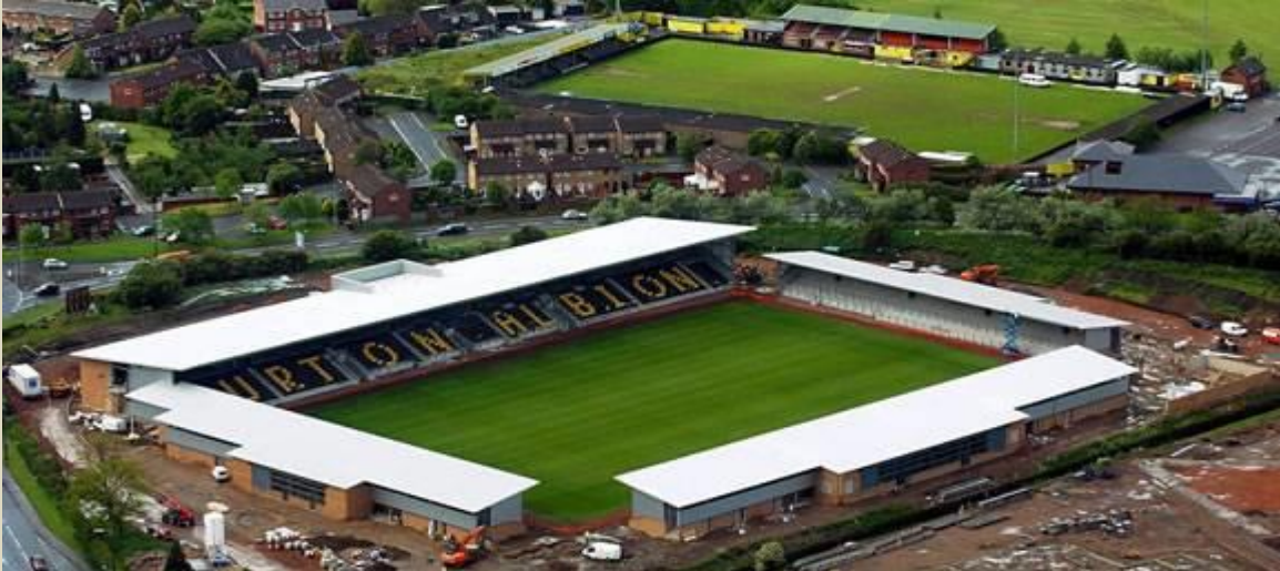
Eaton Park & Pirelli Stadium