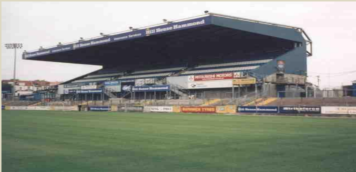
The Main Stand

The Memorial Ground where the club moved to the stadium in 1996 and two years later bought the ground from the then owners Bristol Rugby Club and although the Memorial Stadium has seen some changes since the Rovers took up residence, it still has the feel of a rugby ground about it.