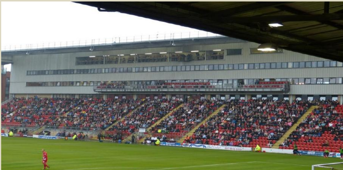
The west Stand (nickname the office Block)

At the North End is the ground is the most recent addition to the stadium. The North Stand was opened at the beginning of the 2007/08 season and replaced a former open terrace. This simple looking covered all seated stand, has space for 1,351 spectators and is near identical to the Tommy Johnston Stand.