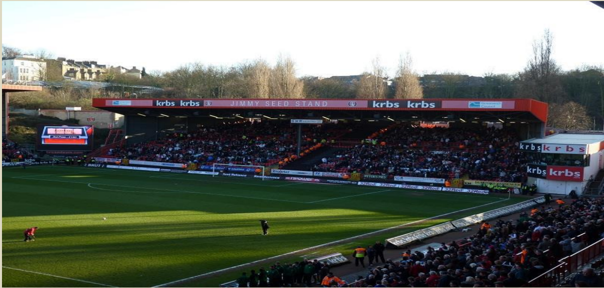
Jimmy Seed Stand (Away End)