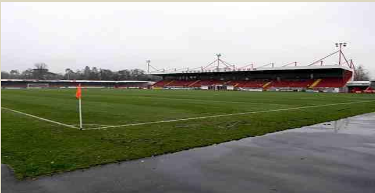
The Main Stand and North Stand

This Red Devils moved from Town Mead where they had played since 1948 to the new Broadfield Stadium which was opened in 1997. The stadium is dominated by the good sized West Stand on one side and runs for about two thirds the length of the pitch. It is raised above pitch level meaning that fans have to climb a small flight of stairs at the front to enter the seated area. The stand also has windshields to either side, plus three unusual looking floodlight pylons on its roof with a capacity of 1,150 seats.