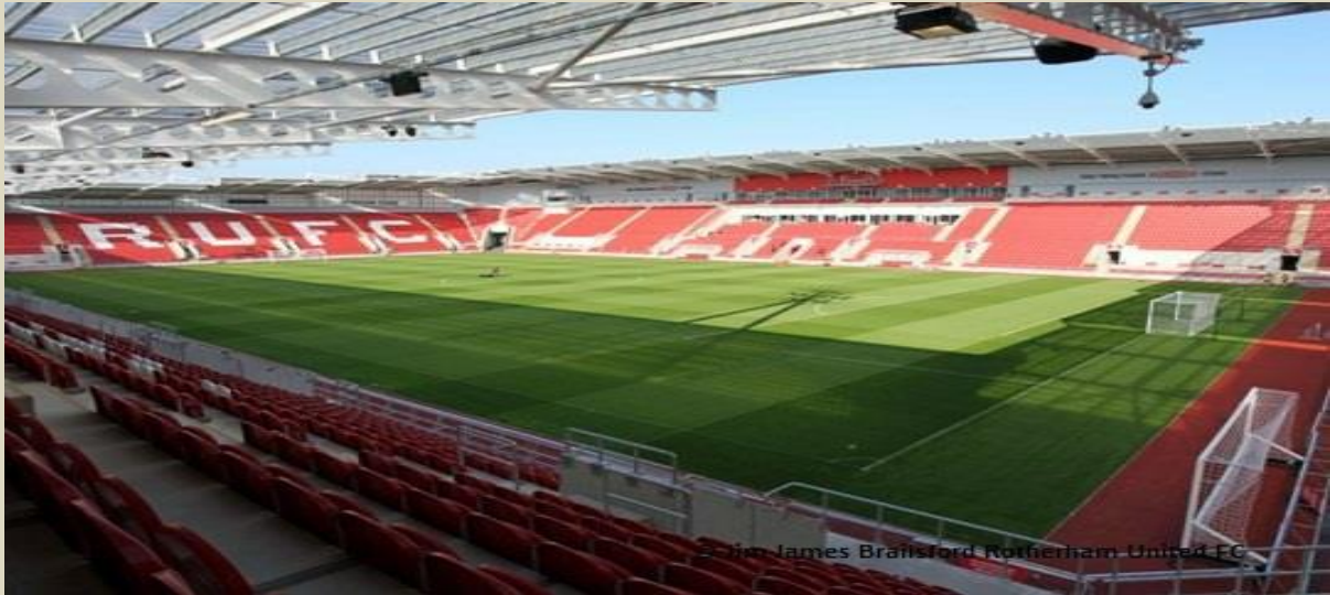
South & West Stands

For the away fans the Bluecoat pub at The Crofts are three hundred yards away from the station having visited before I knew that this is one of the better Weatherspoon where the staff seems to be fairly well clued up. Surprise, surprise, the Real Ale was served at a more ambient temperature and in decent condition, therefore much more acceptable. The only disappointment was that I thought the beers on offer were not as interesting however this obviously depends on personal taste.