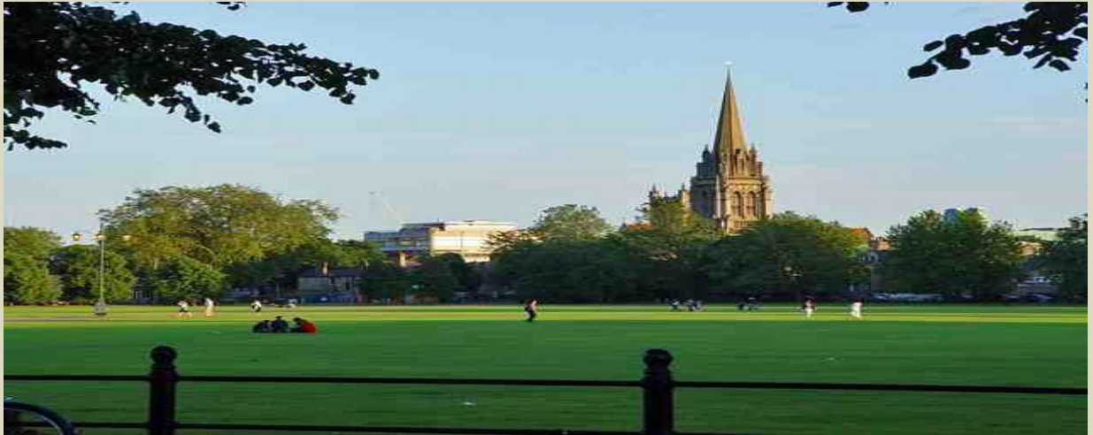
Parkers Piece (1912 – 33) (The birth of Football Association Rules)