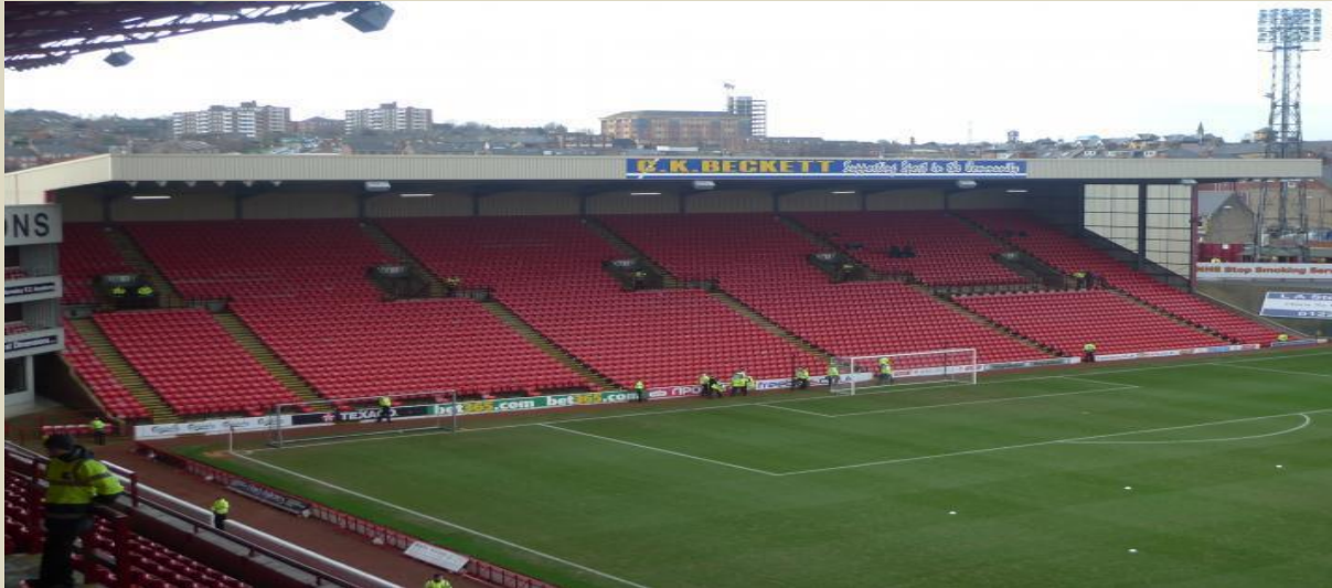
Pontefract Road End

At the Pontefract Road End is an all seated, covered stand for home supporters, which has a capacity of 4,500 and this stand was opened in 1995 and at the other end, the North Stand, was previously an open terrace, but is now a relatively new single tier, covered stand; Visiting supporters are seated in the North Stand. Who normally get about 2,000 to 6,000 fans varies according to demand and this is the most recent addition to the ground being opened in 1999 and has greatly enhanced the overall look of Oakwell with the North Stand being shared between home and away supporters.