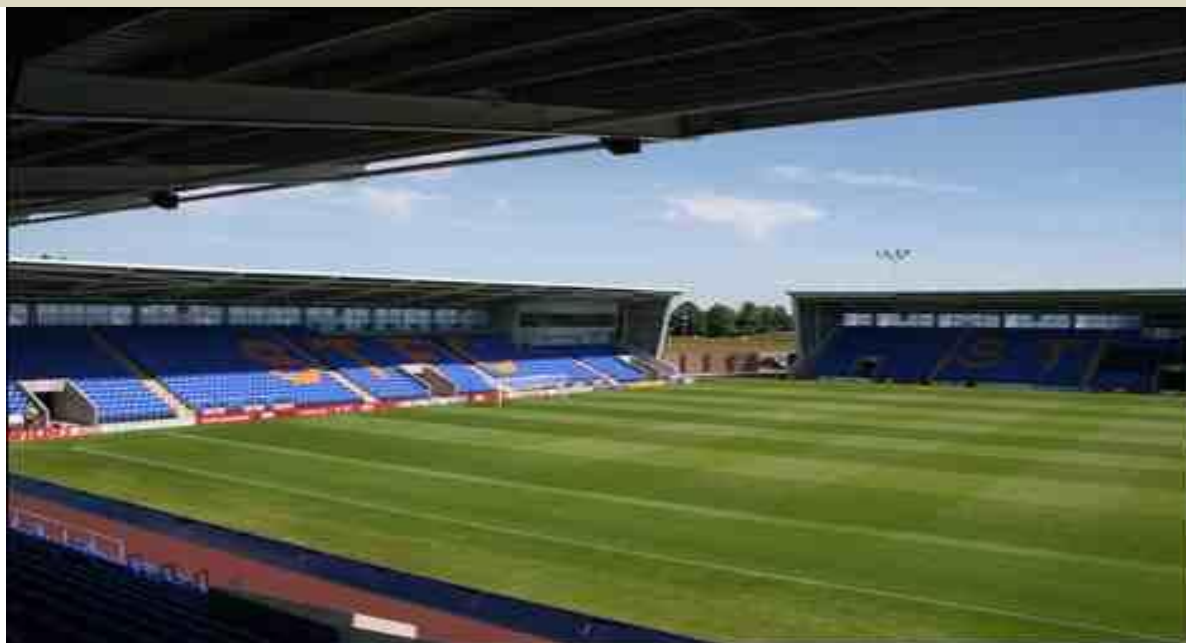
Pro Vision Stand (North Stand)

In addition, there are several corporate and hospitality suites, which the club uses both on match days and for general community use, therefore assisting the club in gaining revenue. Following consultation with supporters' groups, the stadium consists of blue seating, with the club's initials (STFC) spelt out in amber on each side of the ground. This is following considerable outcry when the club initially stated that seating would consist of the club's original blue and white colour scheme. Despite originally being blue and white, the club has adopted a distinctive blue and amber colour scheme since the 1970s, which many supporters feel is a unique and distinctive part of the club.