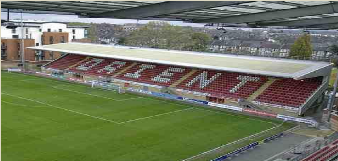
Tommy Johnston (South Stand)

The old Main (East) Stand, which was originally opened in 1956, has been reduced in length, with the stand partly covered is now all seated after having seating installed on the former paddock front terrace. The only downside is it has several supporting pillars and the roof doesn't quite cover all of the front seating. It does though still have a gable on its roof which has 'Leyton Orient'.