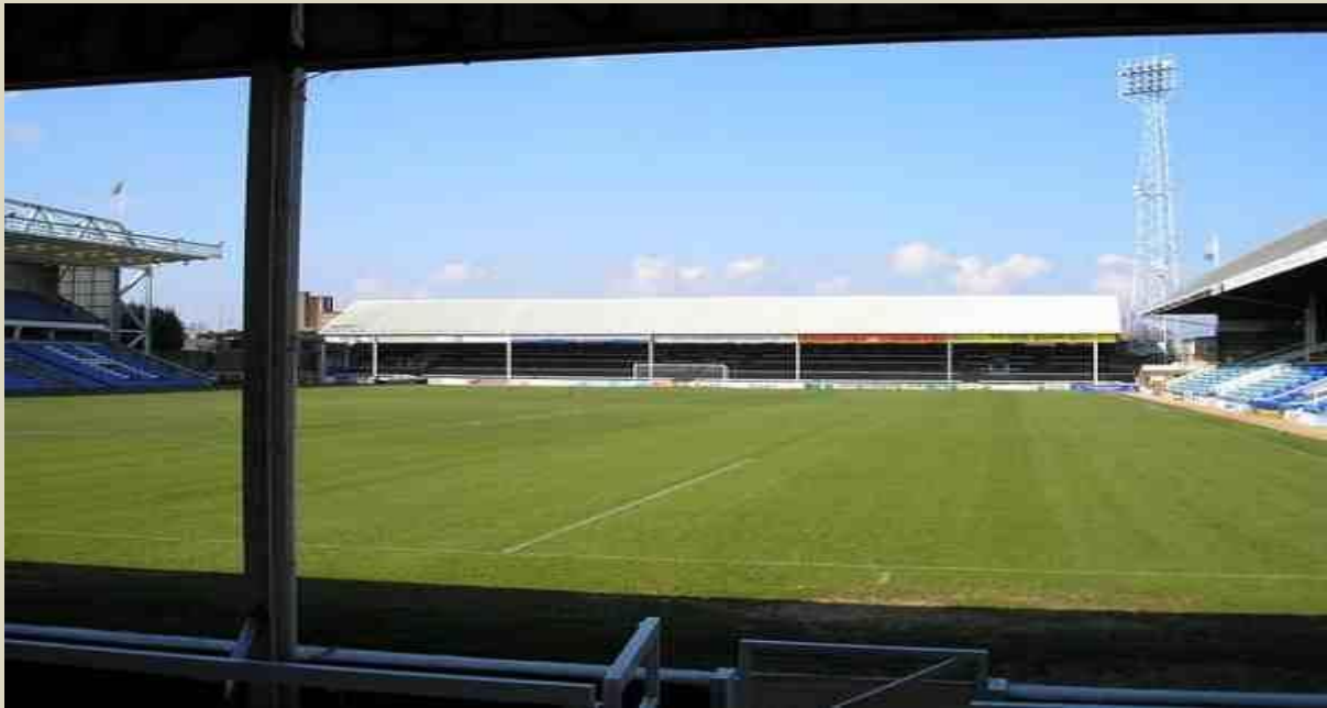
London Road End

and go into the right hand lane and at the next roundabout take the sign for the Outer Ring Road A563 and continue up to Palmerston roundabout then take a left onto A6 follow the road to the Garby Hotel at the cross roads and take a left the at the roundabout take the first exit then at the lights at the cross road at the Hong Kong restaurant (On your right) take the signs for Peterborough A41 and at junction 15 exit the A47 and at the roundabout take the third exit onto Nene Parkway and then take the second exit onto Oundle Road then at the junction just after the railway bridge go straight on down to the ground.