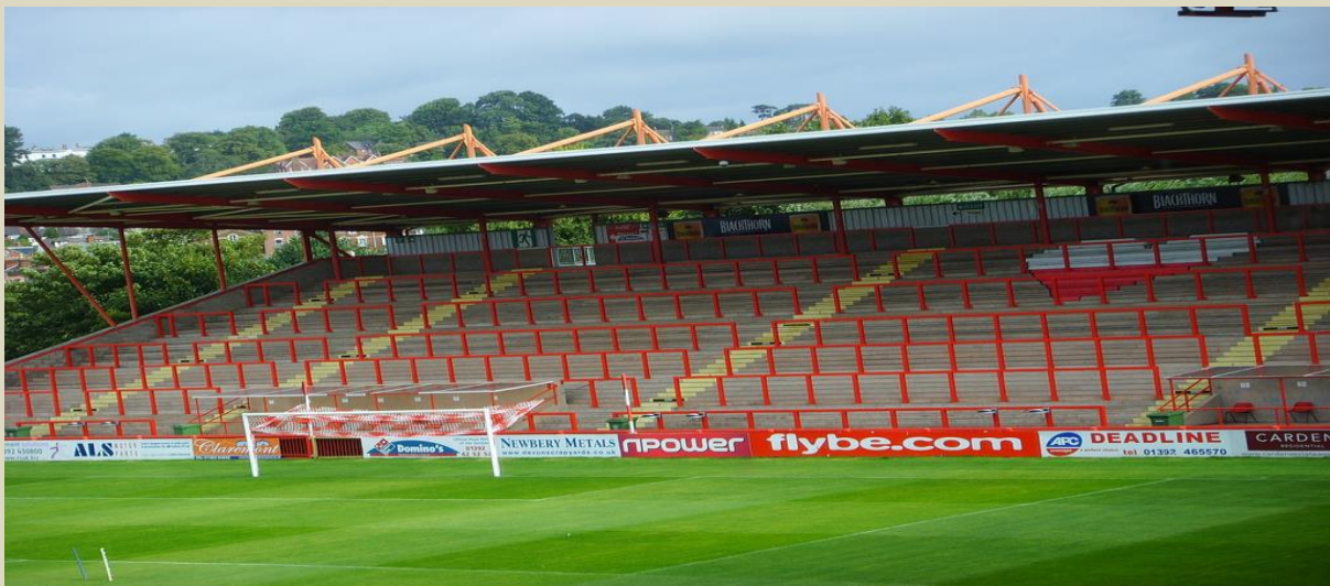
Big bank End

Exit the M5 at junction 30, and then follow the signs for Middlemoor. Take the second exit at Middlemoor roundabout (signed Heavitree). Follow signs for City Centre, going through Heavitree (approx. 2 miles). Past the police station on your right, then at the bottom of the hill turn right at the roundabout into Western Way (signed Pinhoe and Broadclyst). At the next roundabout, take the second exit, and then at the top of the hill (Old Tiverton Road) first left into St. James' Road.