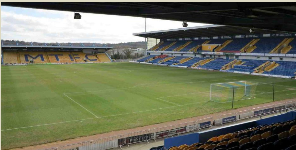
The West Stand (Ian Greaves) & Quarry Lane

The ground was first played on by the local cricket club which was a large piece of land between today's Sibworth Street and Portland and encompasses today the plastic pitches the main stand and the whole of the ground where The Ian Greaves Stand currently the largest stand made up of an upper and lower tier, and executive seating.