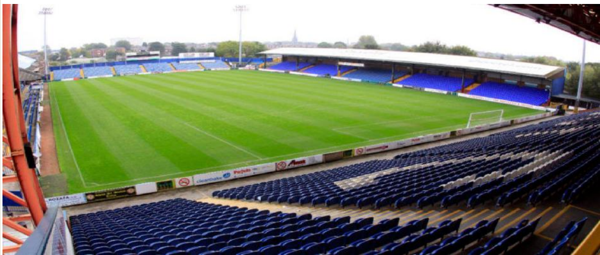
Hardcastle and the Railway End

Exit the M6 at Junction 19 (sign-posted 'Manchester Airport, Stockport A55, M56 East') and at the roundabout turn right onto the A556. At the Bowden roundabout after 4.2 miles, turn right (sign-posted 'Manchester M56') onto the M56. Exit the M56 after 6.9 miles (sign-posted 'Stockport M60, Sheffield M67') onto the M60. Exit the M60 at Junction 1 ('sign-posted 'Stockport Town Centre and West').