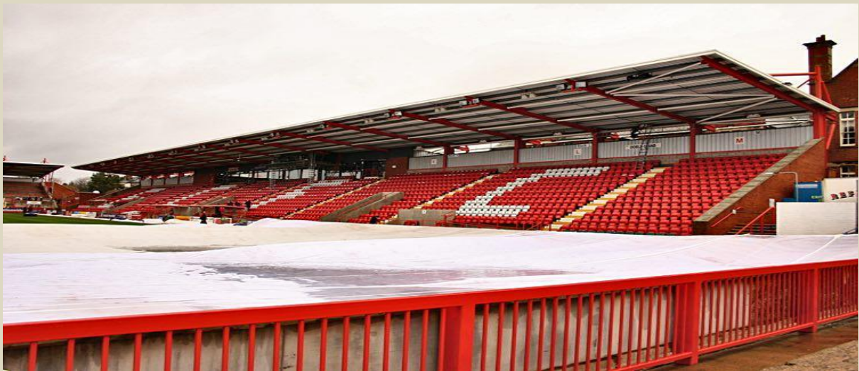
Ivor Doble Stand

At one end is the 'Big Bank' covered terrace, which was opened in February 2000 and replaced a former open terrace. This stand is quite impressive looking and with a capacity of just under 4,000, means it is now the largest terrace left in the Football League. Unusually both the Flybe & Big Bank Stands have an open gap between the roof and back of the stands.