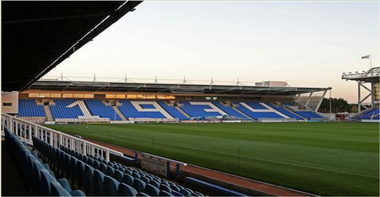
New Moy End (Motorpoint Stand)

The Palmerston Arms at 82 Oundle Road The range of beer, using several from Bateman's, together with several from the local area as well as two from Manchester (Oldershaw's & Phoenix) and one from Newcastle (Mordue), was superb. It has along with staffs that are easy going, pleasant and efficient and the beer is gravity fill and taste better for it. Going there follow the directions to the ground instead of taking a left to the ground take a right into Oundle Road walk past the Cherry Tree to the Palmerston and its 300yards back to the ground.