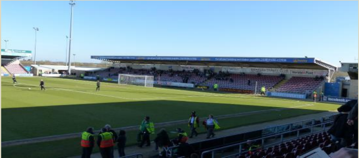
Moulton College Stand

The Sixfields stadium is well signposted around the area. There is a fair sized car park located at the ground, which costs £3. Make sure though that you arrive early as it has been known for it to get full for the more popular games. Parking in the nearby cinema and restaurant car parks is not allowed, so make sure that you only use the official football parking provided at the ground.