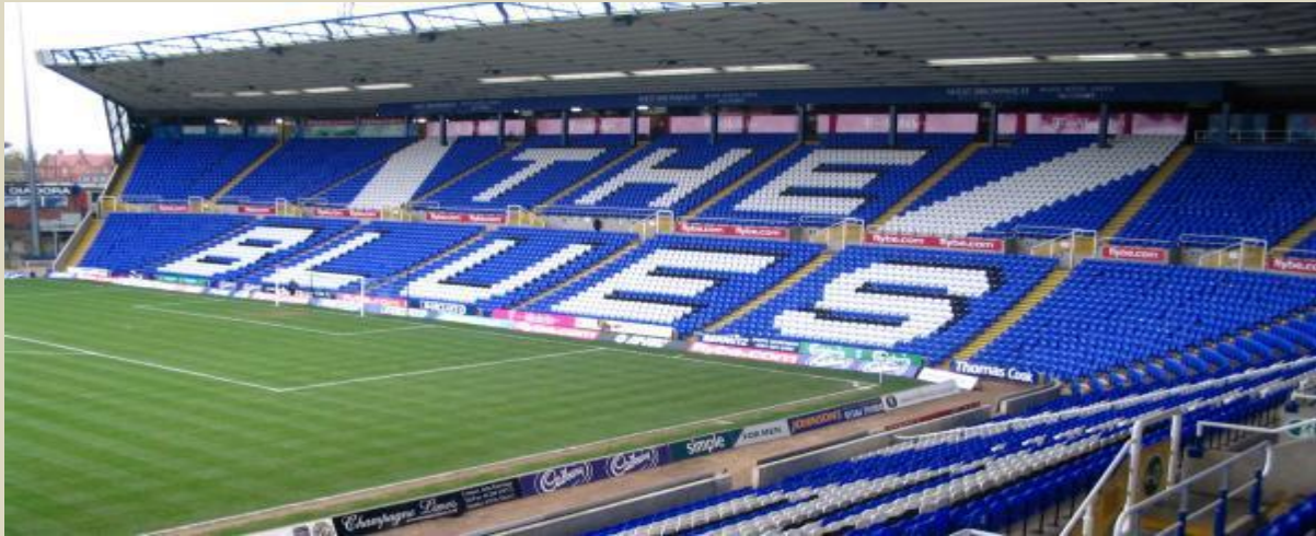
Spion Kop End

After the Hillsborough Disaster in Sheffield three quarters of the ground was rebuilt in the mid 90's. One large two-tiered stand, incorporating the Tilton Road End and the old Spion Kop end, completely surrounds half the pitch and replaced a former huge Spion Kop terrace.