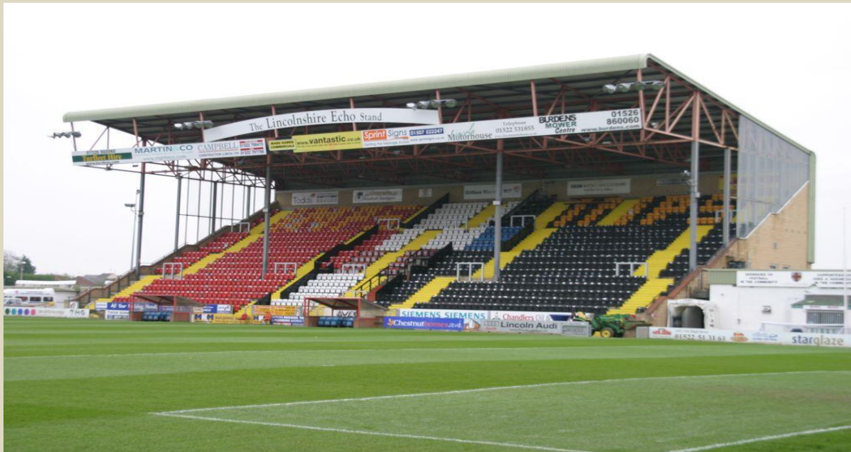
Lincolnshire Echo Stand