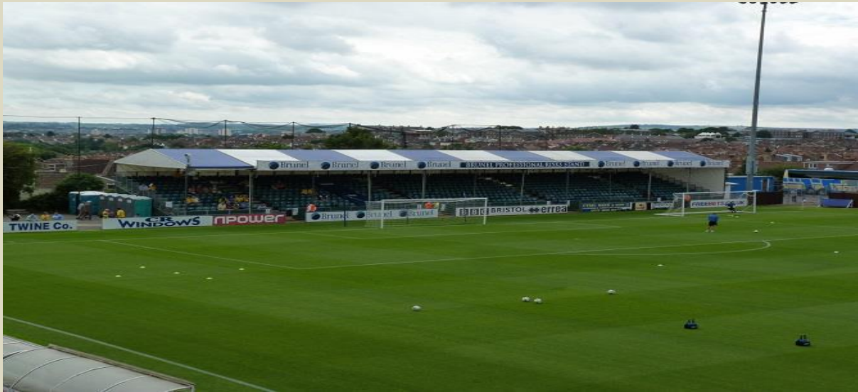
South Stand

width of the pitch, has several supporting pillars running across the front and has been nicknamed 'the tent' by Rovers fans. Opposite is the Blackthorn End, which is a covered terrace for home supporters.