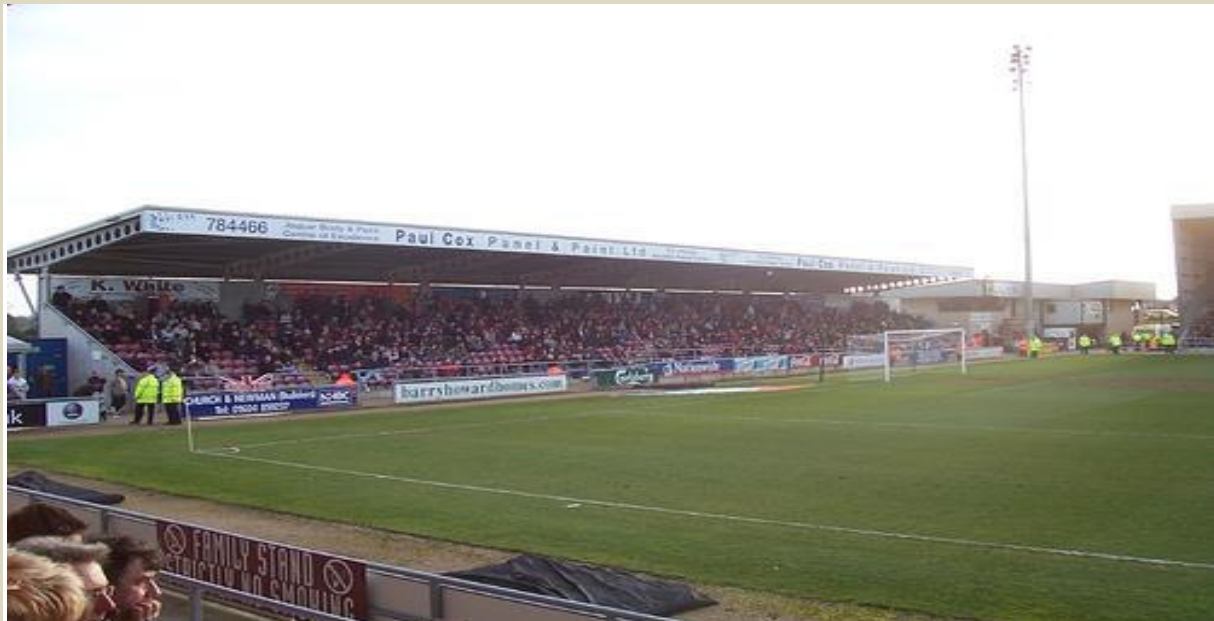
Sheinman Stand Away grounds

The West Stand largest of the stands, seating for 4,000 home supporters on a match day, the West Stand also accommodates the club offices, changing rooms and supporters bar.