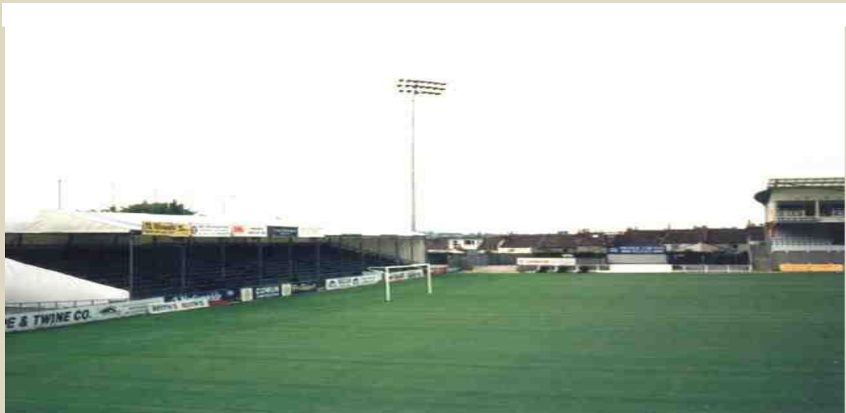
North Stand (Patrick Snowsell)

On one side of it, towards the Blackthorn end is a small covered terrace, used as a family area, whilst the other side has a small covered area of temporary seating, called the South West Stand. Opposite is the Uplands Stand, taller than the West Stand, but similar in length. This stand has covered seating to its rear and terracing at the front. It has open terracing to either side, one of which is given to away supporters. The team dug outs are located in front of this stand, although the dressing rooms are located behind the West Stand. This leads to quite a procession of players and officials at half time and full time.