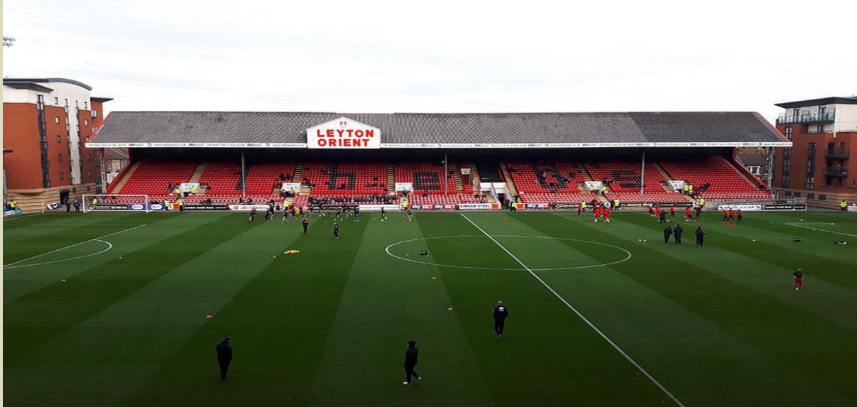
The East Stand

cameras and press and the roof of the stand contains a lot of Perspex panels to allow more light to reach the pitch which is common these days, at one end is the single tiered, Tommy Johnston (South) Stand (capacity 1,336 seats), that was opened in 1999. This stand replaced a former open terrace and is named after the club's leading all time goal scorer who achieved that in 1958 with 35 goals.