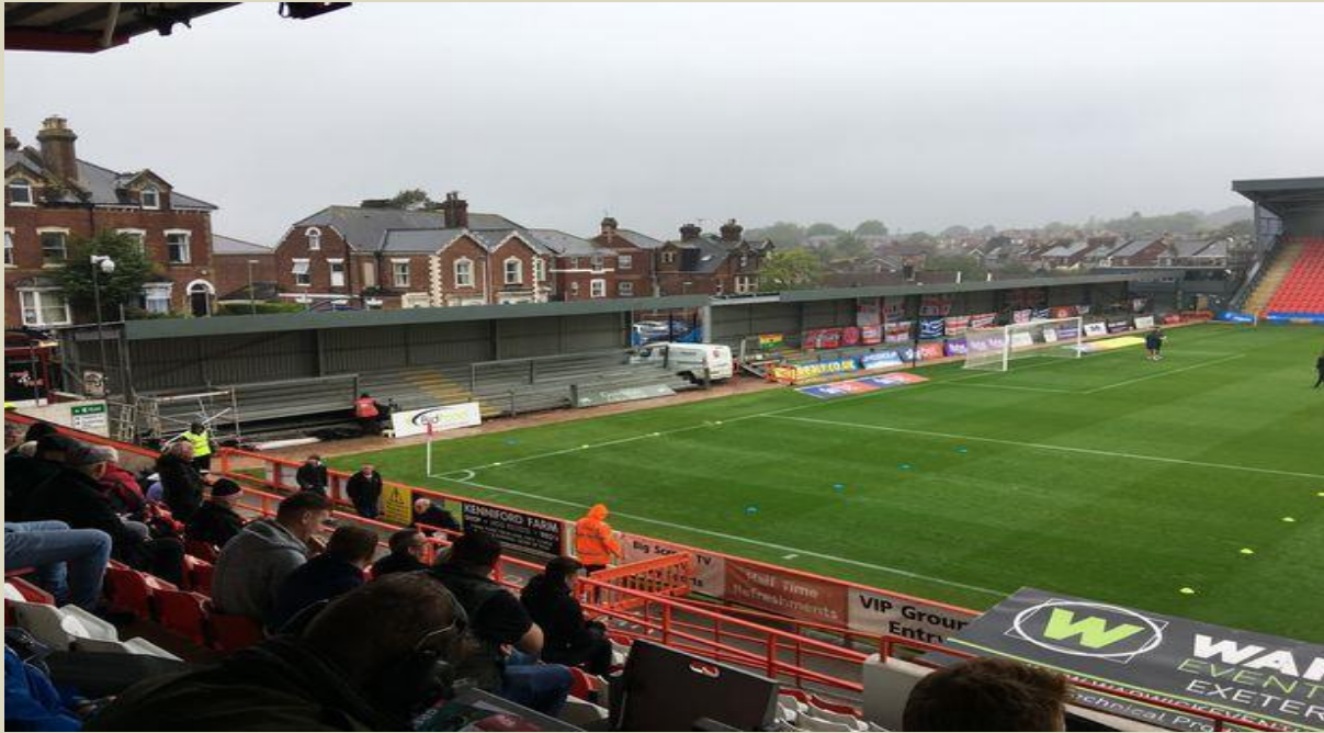
The St James End