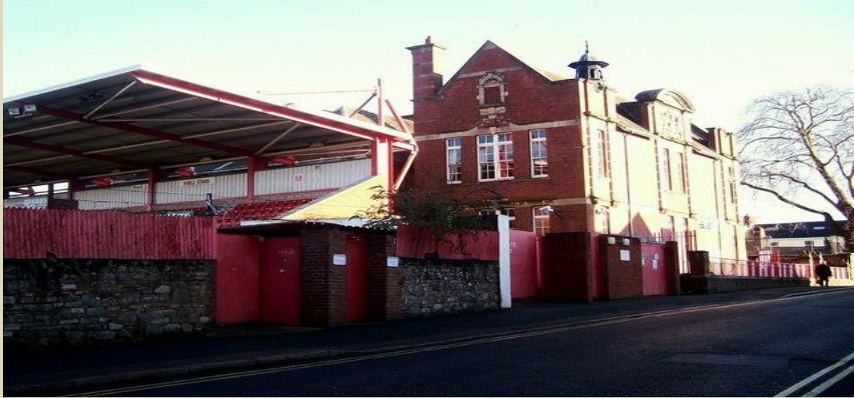
St James Terrace end

At one end is the 'Big Bank' covered terrace, which was opened in February 2000 and replaced a former open terrace. This stand is quite impressive looking and with a capacity of just under 4,000, means it is now the largest terrace left in the Football League. Unusually both the Flybe & Big Bank Stands have an open gap between the roof and back of the stands.