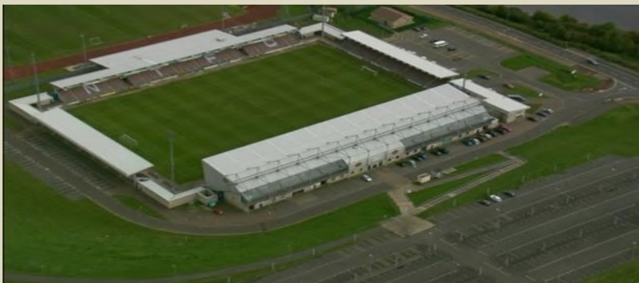
Big ME aerial