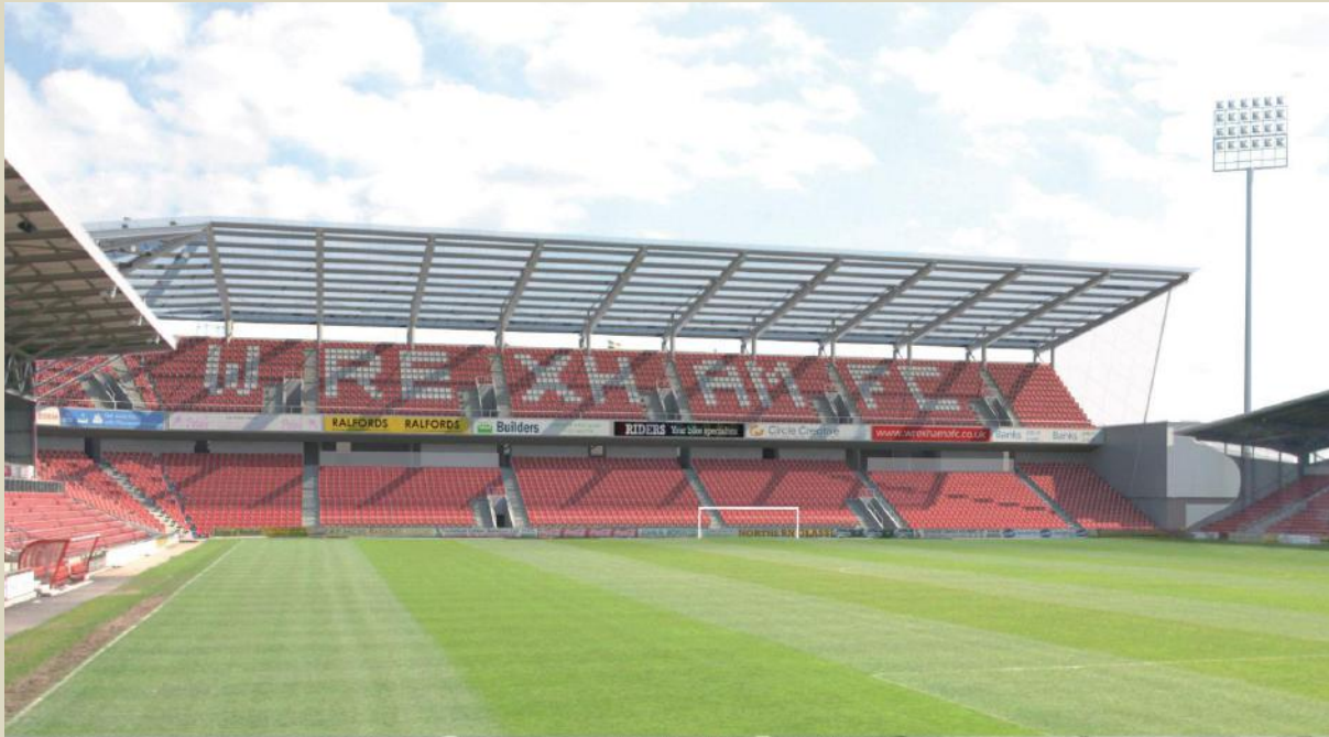
The new kop

Take the M54 from the M6 (Junction 10A Northbound). Follow the M54 to the end of the motorway and join the A5 towards Shrewsbury. Continue on the A5 past Shrewsbury and Oswestry and then join the A483 towards Wrexham. Stay on the A483 as you reach Wrexham (this is the Wrexham by-pass). Leave the A483 at Junction 15 on to the A541 Mold Road. At the roundabout take the first exit on to Mold Road then go straight through the next roundabout and the ground is 200 yards from this junction on the left. There is also parking available at the nearby Glyndwr University (£3) or NEWI on the Plas Coch Retail Park which cost £2