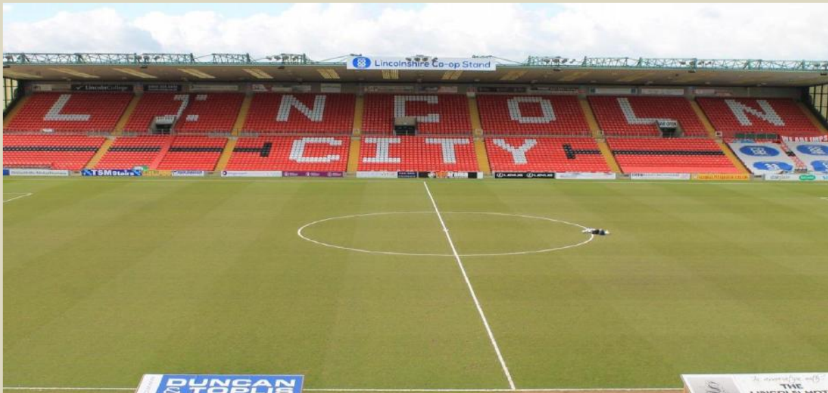
Coop Community Stand

The longer way from the Lincoln Railway Station is around a 19-minute walking pace to the ground unless you take in the pubs on the High Street. Turn 'left out of the train station and walk up to the traffic lights, turn left at these traffic lights onto the High Street, walking over the railway level at the crossing, keep walking for 10 minutes before turning left into Scorer Street, then walk along Scorer Street until you come to a bridge across the river, then turn right immediately after crossing the bridge onto Sincil Bank, the ground is straight ahead.