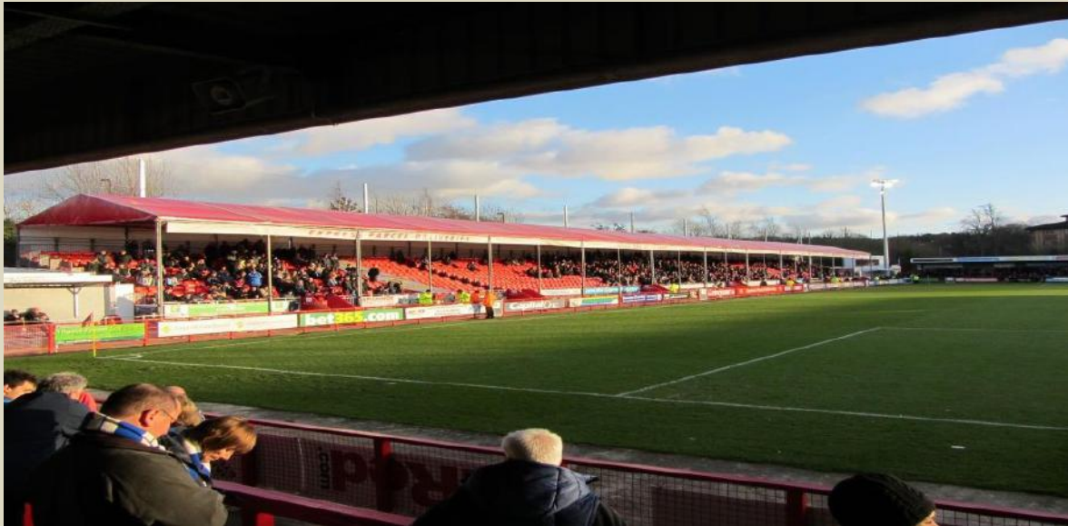
The East Stand

The North & South ends are virtually identical; with Away fans are accommodated up to 1,750 in the North End. Both the North & South covered terraces that extend around both corners of the ground towards the West Stand, enclosing the stadium at those points. The stadium perimeter is surrounded on two sides by a number of trees and the club have raised the capacity to 6,134.