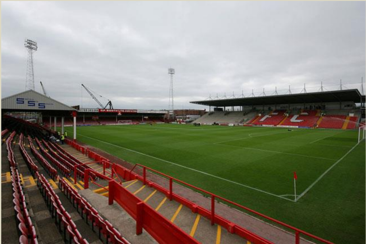
Don Valley Stadium (Sheffield) (2008-2012)

Red House Ground – 1870 – 1907 Milmoor (1907 – 2008)