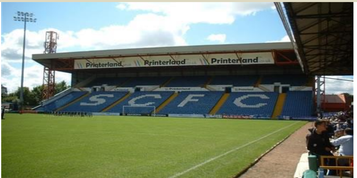
Cheadle Park End

Edgeley Park has 11,000 all seated capacity. The large Cheadle End Stand which towers over the rest of the stadium and was opened at the beginning of the 1995-96 season is two-tiered, covered and all seated and it has a large lower tier, with a smaller upper tier above. Opposite, is the Railway End, a former open terrace which was converted to a seating area in 2001 and above the Railway End is a small electric score board.