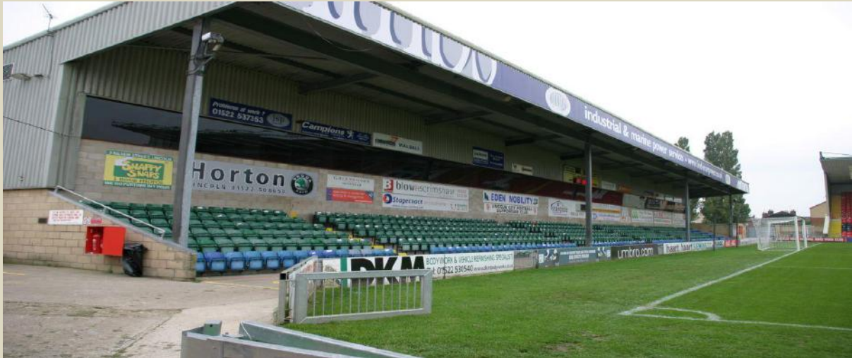
Bridge McFarlane Stand